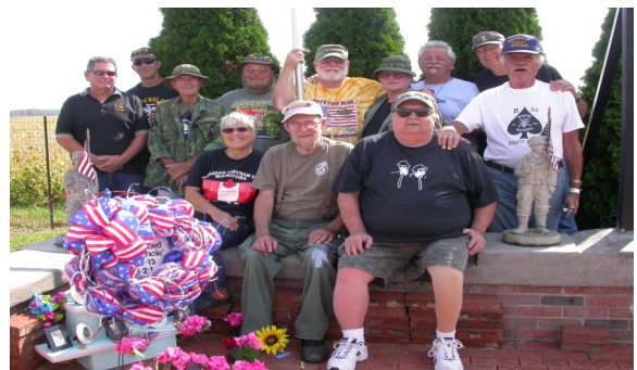
Kokomo, IN 2014